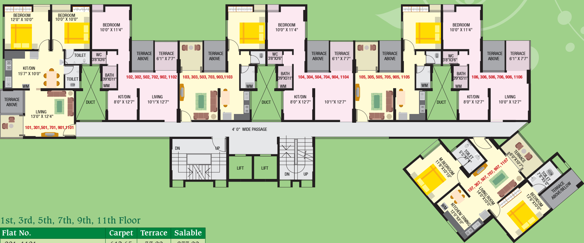
1st, 3rd, 5th, 7th, 9th, 11th Floor