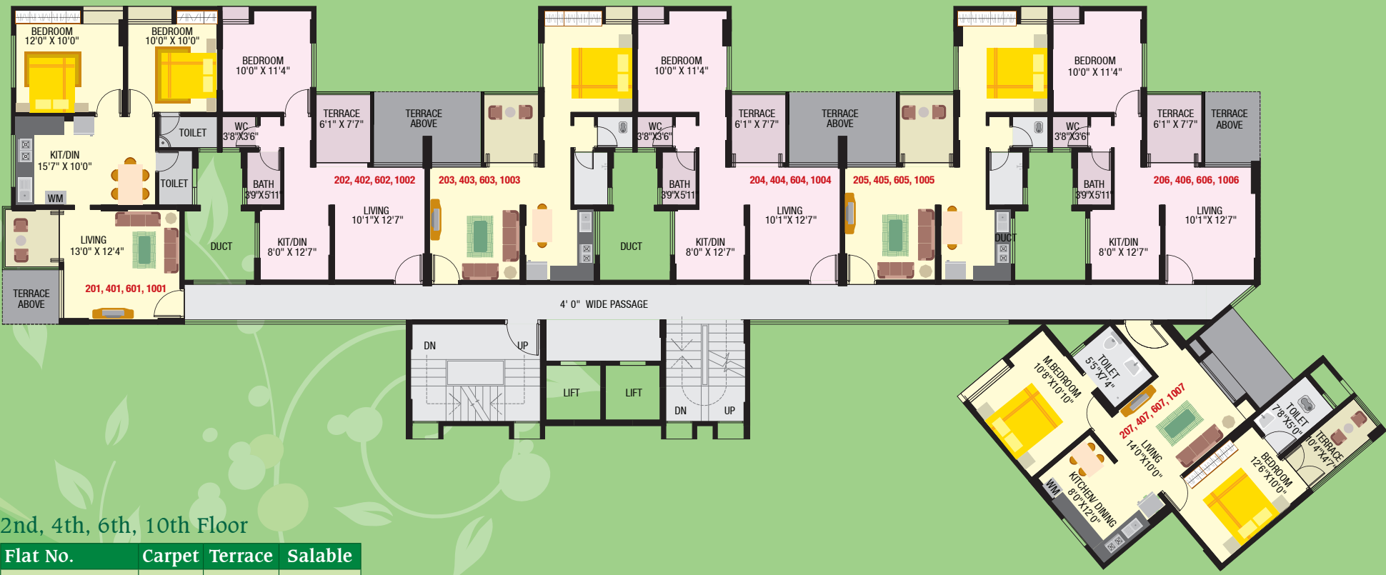
2nd, 4th, 6th, 10th Floor