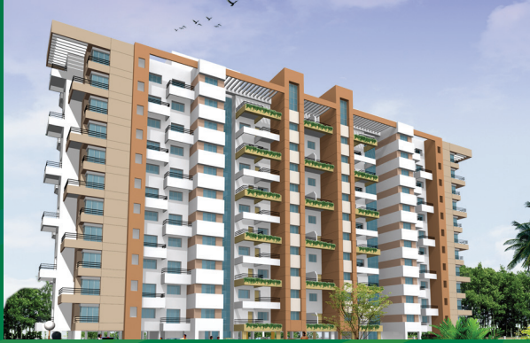
Phase 1 completed