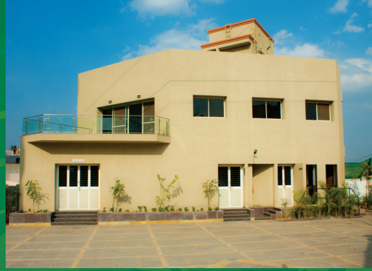
Club House Ready