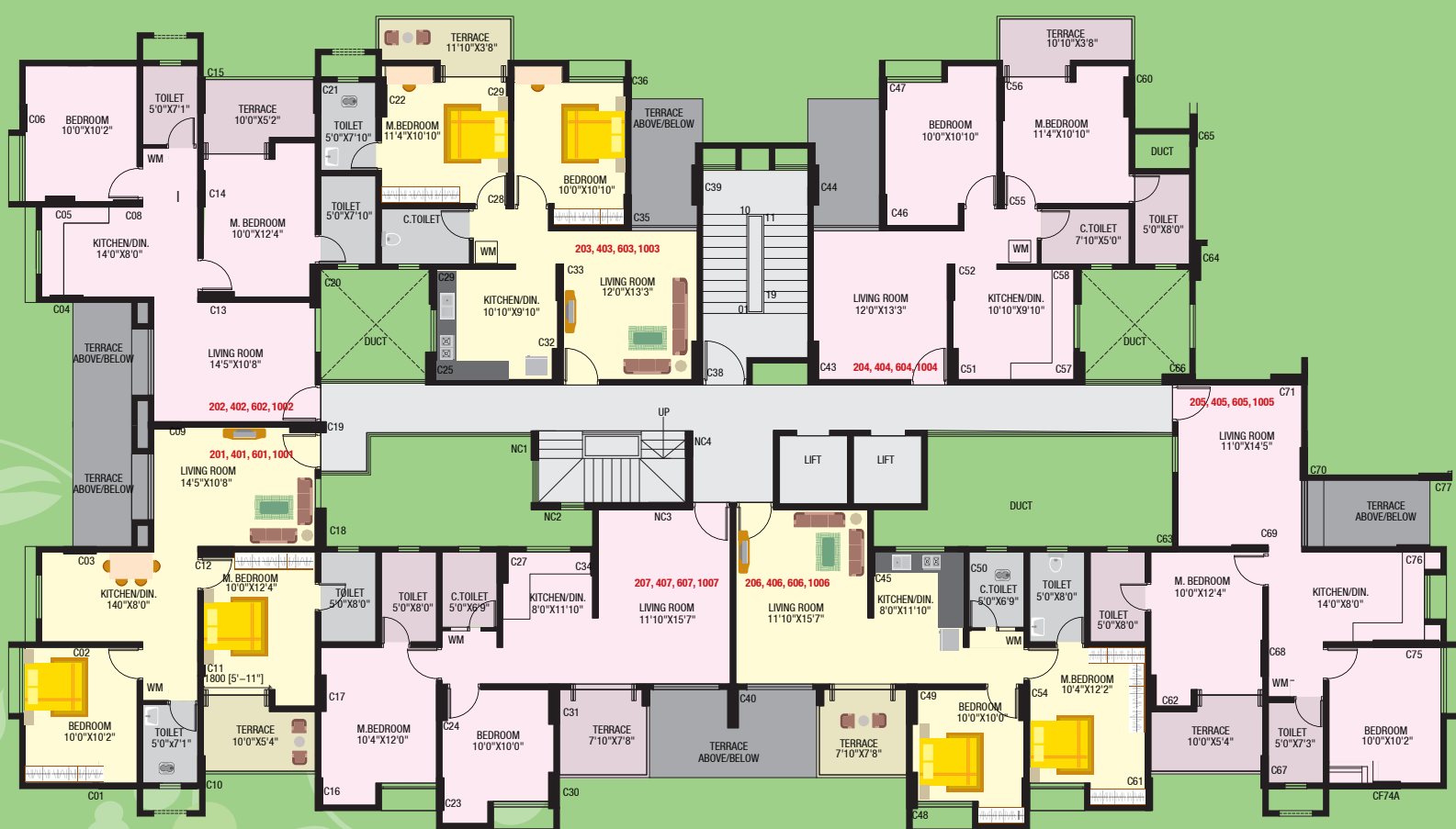
2nd, 4th, 6th, 10th Floor