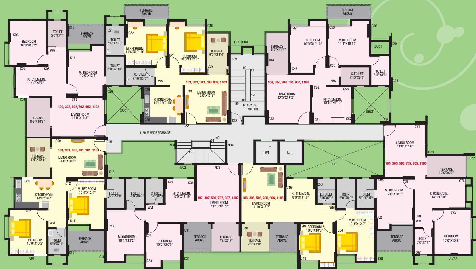
1st, 3rd, 5th, 7th, 9th, 11th Floor